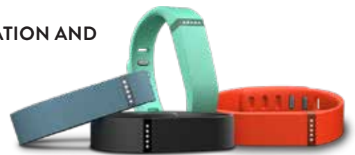
Actual FitBit may vary.

JOIN US FOR NETWORKING, CONVERSATION AND THE CHANCE TO WIN A FITBIT.